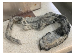
Wad of rags pulled from a Lift Station Pump

2020 has been a challenging year for many of us and our staff has worked hard to maintain the sanitary district and resolve emergencies. Please help keep our technicians safe by giving them clear and appropriate space to work. We want them to remain safe and healthy to serve you! We ask all residents of the District to please only flush human waste and toilet paper down your toilet. Our technicians continue to find wipes, rags, hygiene applicators and even underwear in the sanitary lift pumps. All these clog damage the pumps and increase costs for the district. Products labeled flushable and biodegradable need to go in your trash—not your toilet. These are a few of the products that damage the sanitary district pumps: